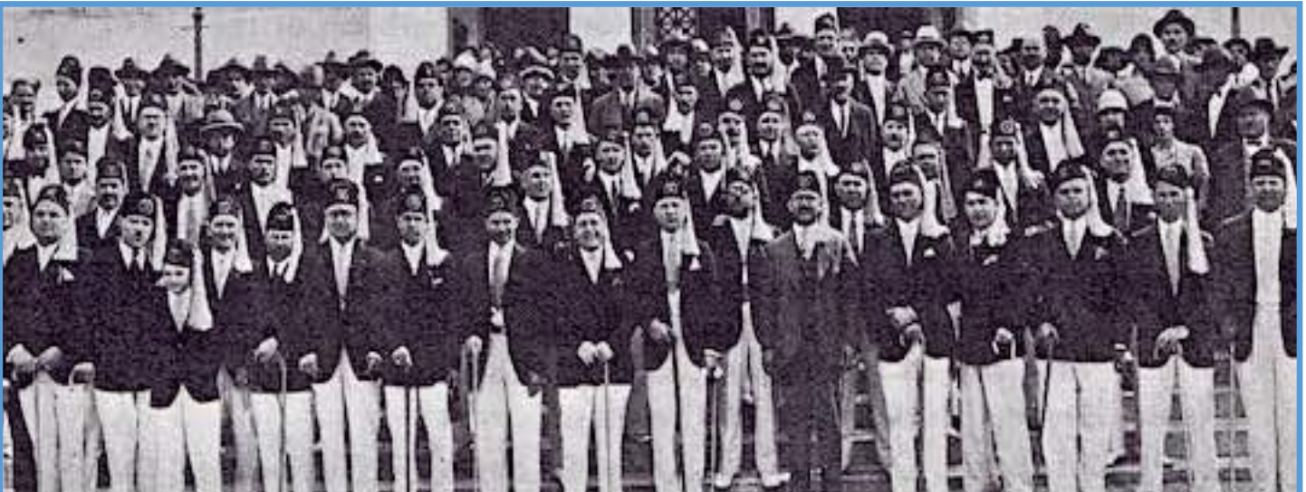
The 1930 Ahepa Excursion to Greece sailed on hoard the S.S. Saturnia from New York City

You can pay for your ticket by Interac e-transfer to: montreal@ahpepa.ca