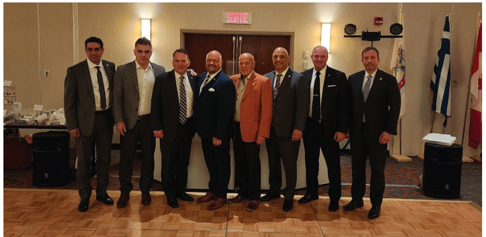
Members of the new District lodge