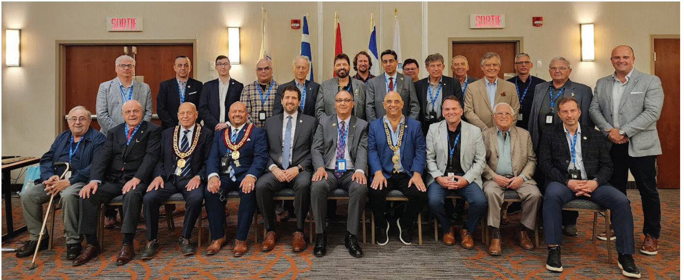
Group photo of AHEPA delegates